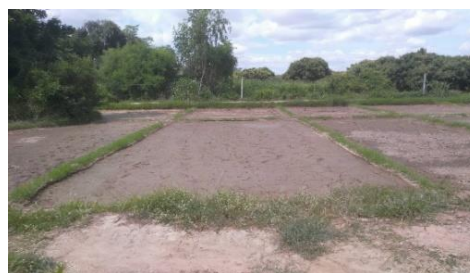
Figure 2. Experimental field in Ban Thi district, Lamphun, Thailand.

The main factors in this research were the green manure managements (no green manure; Control, Crotalaria juncea ; Crotalaria and Sesbania rostrata ; Sesbania ). Each green manure factor was separate into 2 water managements of continuous flooding; CF, and alternative wetting and drying; AWD. Combination treatments were Control-CF, Control-AWD, Crotalaria -CF, Crotalaria -AWD, Sesbania -CF and Sesbania -AWD. All treatments were performed in triplication. Each field study was 5 m × 5 m (0.0025 ha) separated by bunds (Figure. 2). Raw data was collected in two phases. First, inputs were collected from materials used in each activity of organic Riceberry production and then separated into 5 sources of inputs (fuel, machinery, labor, fertilizer, and seed). Second, outputs were collected from paddy and straw yields after harvesting process.